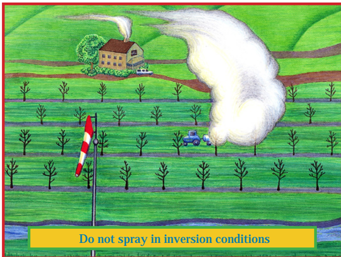
Do not spray in inversion conditions