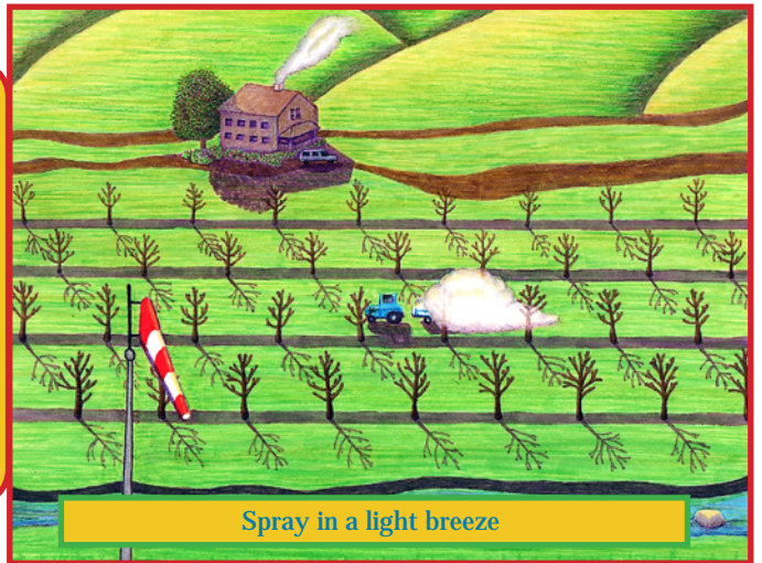
Spray in a light breeze