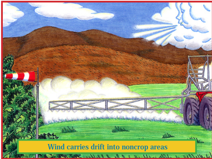
Wind carries drift into noncrop areas