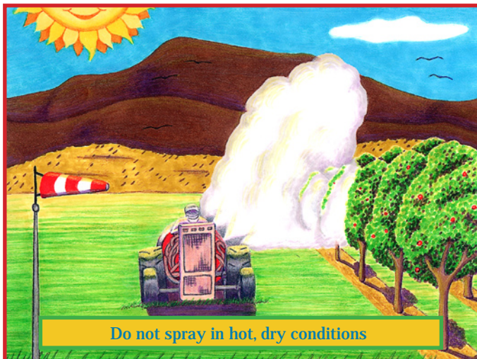
Do not spray in hot, dry conditions